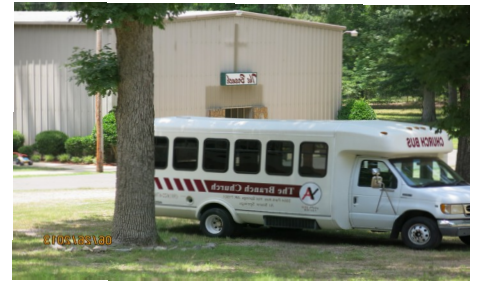
The Branch has nice, clean facilities and well-kept grounds.